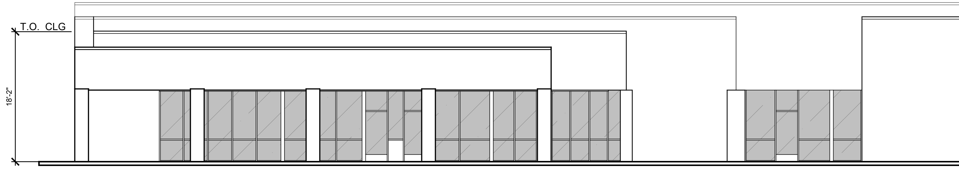
EAST ELEVATION SCALE: 1/8" = 1'-0"